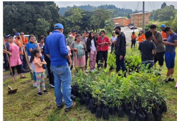
R: Tres Rios youth at the end of a trash clean-up project. ● L: Youth preparing to plant trees in a local park.