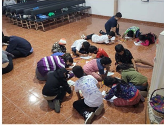
Children in the worship space at Tres Rios Presbyterian Church during Thursday evening programs.