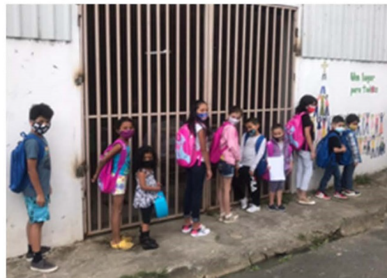
Children in front of the Tres Rios PC building, showing off their new backpacks filled with school supplies.