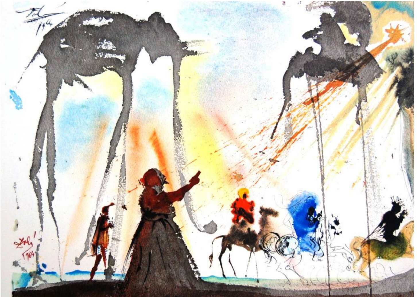
Travels of the Three Kings by Salvador Dalí

The Newsletter of the Ewing Covenant Presbyterian Church January 2024